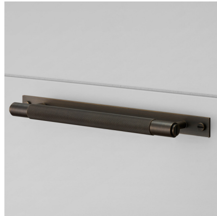
Shown in smoked bronze

Buster + Punch's Pull Bar is refined by hand and features their signature diamond-cut, cross-knurl pattern. It is paired with a Solid Metal backplate and matching screws. Black: Made from Aluminum and then anodized to give a deep Black finish. Brass: Made from precision-machined solid brass and finished with two layers of durable satin lacquer. This finish will age slowly, moving from radiant brass to deeper and golden within a few years. Smoked Bronze: This is a living finish, meaning the more it is used the more the base Brass will show through. It will age with you. Steel: Made from solid stainless steel and refined by hand. Steel is Buster + Punch's most durable finish and will remain the same for years to come.