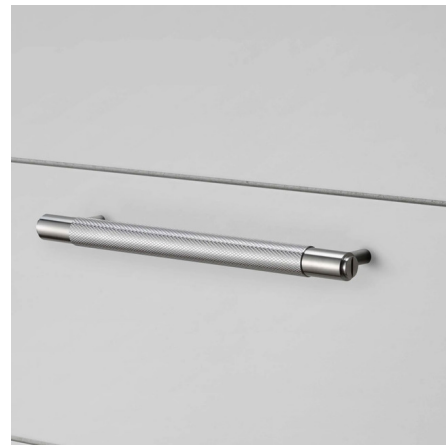
Shown in steel

Buster + Punch's Pull Bar is refined by hand and features their signature diamond-cut, cross-knurl pattern. Black: Made from Aluminum and then anodized to give a deep Black finish. Steel: Made from solid stainless steel and refined by hand. Steel is Buster + Punch's most durable finish and will remain the same for years to come. Note: Some size/finish combinations are no longer available.