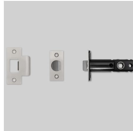
Shown in steel

The Tubular Latch is designed to work with Buster + Punch's Door Handle. Suitable for interior doors only.