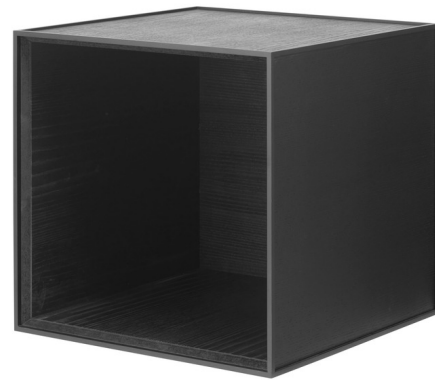
Shown in black stained ash

The Frame Cabinet series is a flexible storage system consisting of square modules for a cubistic style. The cabinets may be mounted to the wall or stand on their own on the floor to serve as a bookcase, nightstand, or any number of other configurations. The Frame collection is manufactured and assembled by hand in Denmark. Available in melamine or wood veneer with metal trim. Note: The 19.3 inch cabinet includes an interior shelf. The 11, 13.8, and 16.5 in. cabinets do not include a shelf.