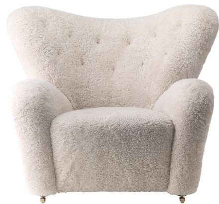
Shown in natural oak / moonlight sheepskin

Originally created by Danish designer Flemming Lassen in 1935, the Tired Man Chair is meant to make whoever sits in it feel as warm and safe as a polar bear cub in the arms of its mother in the middle of the ice cap. The Tired Man's organically curving silhouette and enveloping seat and back provide a delightfully plush spot to relax. Blocky oak legs with front casters complement the oversized seat, and a choice of sheepskin or fabric upholstery allow for a casual, inviting look or a more refined feel.