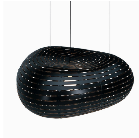
Shown in black exterior / black interior

The Cloud Fully Assembled Pendant is inspired by clouds the Polynesians used to navigate islands over the Pacific Ocean. Strips of Bamboo Plywood are placed on the frame to allow light to shine through onto your area. Ships fully assembled.