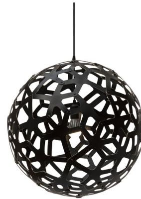
Shown in black exterior / black interior

The Coral Pendant is based on one of the geometric polyhedra that interested David Trubridge since he was a boy. The intricate form is made from just one single component repeated 60 times and lights your space with warm shadows. The Bamboo Plywood shade is available in a variety of color options. Ships flat-packed requiring complete assembly, semi-assembled requiring 5-10 minutes of final assembly per fixture prior to installation, or fully assembled and ready to hang. Largest size ships fully assembled only. Commercial projects/jobsites must order fully or semi-assembled.