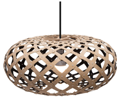
Shown in bamboo exterior / black interior

The Kina Pendant is inspired by the inner shell of the local Maori saltwater sea urchin. Features a Bamboo Plywood shade offered in a variety of colors. Made in New Zealand. Ships flat-packed requiring complete assembly, semi-assembled requiring 5-10 minutes of final assembly per fixture prior to installation, or fully assembled and ready to hang. Commercial projects/jobsites must order fully or semi-assembled.