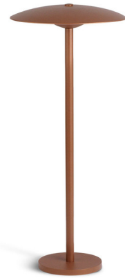
Shown in rust

COLOR RENDERING . . . . . 90 CRI LAMP COLOR . . . . . 2700K LUMENS/WATT . . . . . 32.20 LUMINOUS FLUX . . . . . 161 lumens