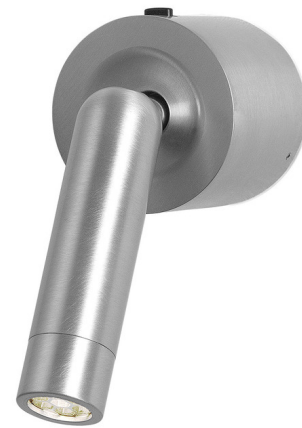
Shown in aluminum