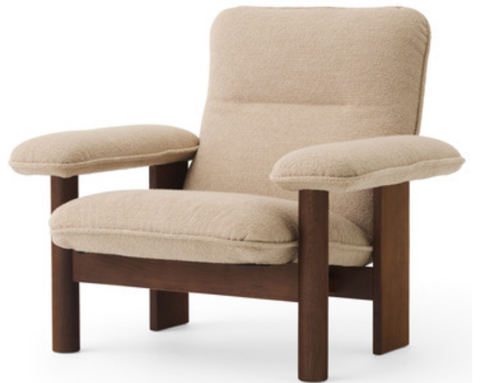
Shown in: Dark Stained Oak / Beige Boucle

The Brasilia Lounge Chair combines elements of modernism and Scandinavian mid-century design to create a comfortable, inviting piece. A low seat and plush cushions provide a luxuriously comfortable seat, which is supported by a chunky, solid wood frame. Available in boucle fabric or Sorensen alinine leather for a modern look, or genuine sheepskin for a bohemian vibe. Note: Not all options are available.