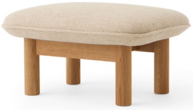
Shown in: Natural Oak / Beige Boucle

DESCRIPTION The Brasilia Ottoman combines elements of modernism and Scandinavian mid-century design to create a comfortable, inviting piece. A plush cushion provides a luxuriously comfortable seat, which is supported by a chunky, solid wood frame. Available in boucle fabric or Sorensen alinine leather for a modern look, or genuine sheepskin for a bohemian vibe. Note: Gold Boucle and Dunes Cognac are only available with Dark Stained Oak finish. Dunes Black and Sahara Sheepskin are only available with Walnut finish.