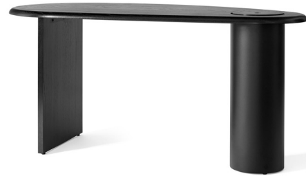
Shown in dark oiled oak / black

The Eclipse Desk, designed by Fred Rigby Studio, features a curved, organically shaped tabletop crafted from solid oak. The top is supported by a flat oak leg and cylindrical steel column that complements the asymmetrical design with dramatic flair. The columnar leg houses a concealed storage compartment to keep the top of the desk clear and clutter-free.