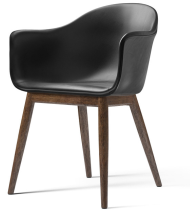
Shown in dark stained oak / dakar black leather

The Harbour Wooden Base Armchair features a clean and minimalist design that is ideal for anything from restaurants, offices, or in your own home. The chair has the perfect balance between geometry and organic shapes while providing ample amounts of back support. Available with a polypropylene and fiber glass hard shell seat or upholstered seat and solid oak legs. Weight capacity tested up to 450lbs. Note: Some combinations of seat color and wooden base finish are unavailable.