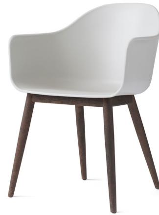
Shown in dark stained oak / white

The Harbour Wooden Base Armchair features a clean and minimalist design that is ideal for anything from restaurants, offices, or in your own home. The chair has the perfect balance between geometry and organic shapes while providing ample amounts of back support. Available with a polypropylene and fiber glass hard shell seat or upholstered seat and solid oak legs. Weight capacity tested up to 450lbs. Note: Some combinations of seat color and wooden base finish are unavailable.