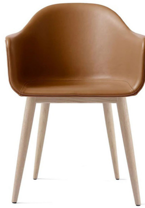
Shown in natural oak / dakar cognac leather

The Harbour Wooden Base Armchair features a clean and minimalist design that is ideal for anything from restaurants, offices, or in your own home. The chair has the perfect balance between geometry and organic shapes while providing ample amounts of back support. Available with a polypropylene and fiber glass hard shell seat or upholstered seat and solid oak legs. Weight capacity tested up to 450lbs. Note: Some combinations of seat color and wooden base finish are unavailable.