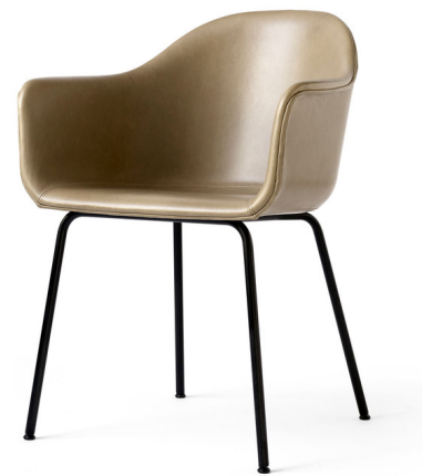
Shown in black / dakar antilop leather

The Harbour Steel Base Armchair features a clean and minimalistic design that is ideal for anything from restaurants, offices, or in your own home. The chair has the perfect balance between geometry and organic shapes while providing ample amounts of back support. Available with a polypropylene and fiber glass hard shell seat or upholstered seat and tubular steel legs. Weight capacity tested up to 450lbs.