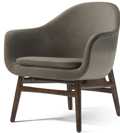
Shown in dark oak / dakar antilop leather

The Harbour Lounge Chair bridges the gap between an armchair and a lounger, with a minimalistic expression and design. Featuring a solid wood frame that embraces the shell which is upholstered in a range of durable fabrics in contemporary colorways. Tested up to 450 pound weight capacity.