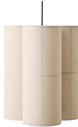
Shown in black / raw linen

The Hashira Cluster Pendant is a modern take on the traditional Japanese rice paper lantern, featuring a cluster of three cylindrical, translucent linen shades over a welded steel frame. Includes black textile cord and black canopy.