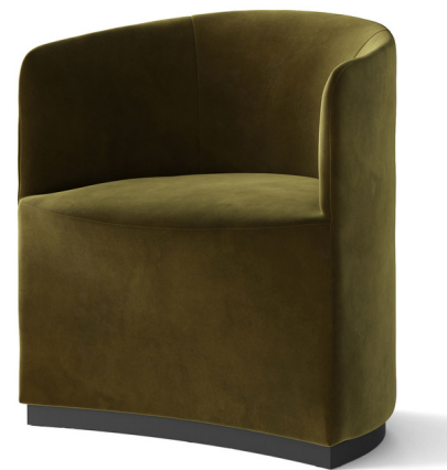
Shown in black / city velvet 031

The Tearoom Club Chair features a timeless silhouette that is inviting without being overly casual. Inspired by the curved frame of Charles Rennie Mackintosh's 1904 Willow Chair, this piece features a gently curving back and sides over plywood and foam construction, ensuring it is as comfortable as it is stylish. The Tearoom Club Chair would make a striking addition to both period and contemporary hotels, lounges, or even private residences.