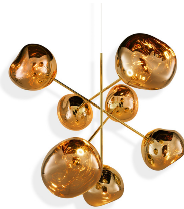
Shown in gold / gold