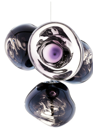
Shown in silver / smoke

The Melt Chandelier features 4 LEDs arranged in a cluster and diffused from organic shades reminiscent of molten glass. The Gold, Smoke, Copper, and Silver polycarbonate shades are translucent when on and mirror-finished when off, creating a mesmerizing visual effect. The Opal shades offer a more traditional look and produce a warm translucent glow.