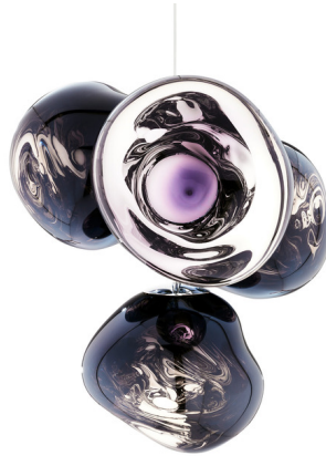
Shown in silver / smoke

The Melt Chandelier features 4 LEDs arranged in a cluster and diffused from organic shades reminiscent of molten glass. The Gold, Smoke, Copper, and Silver polycarbonate shades are translucent when on and mirror-finished when off, creating a mesmerizing visual effect. The Opal shades offer a more traditional look and produce a warm translucent glow.