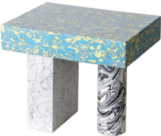
Shown in: Multicolor

The Swirl Low Table features various geometric forms arranged to create a glamorous and whimsical coffee table. Each piece is created with a new material made from excess Powdered Marble residue and mixed with pigment and resin. Due to the nature of pigmentation and the pouring process, each piece features a unique pattern.