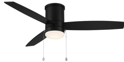
Shown in matte black / matte black