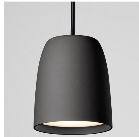
Shown in textured black

The Nut S/10 Pendant brings modern minimalist style to indoor spaces. Crafted out of stainless steel and aluminum, the design features a sleek bell-shaped shade in a textured finish. This mini pendant is ideal as a single piece above a cozy breakfast nook or as a grouping in a dining room, office, or hallway. Note: The included canopy is sized for use with a standard US junction box. It is not shown in the photos but is shown in the line drawing.