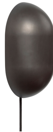
Shown in gunmetal / gunmetal

PRODUCT DIMENSIONS . . . . . Backplate: 3.15"W x 6.1"H