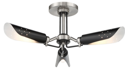
Shown in brushed nickel / coal

The Turbine Semi Flush Ceiling Light features modern, industrial styling with multiple arms emanating from an angular frame in Brushed Nickel finish. Elongated shades with small perforations allow light to escape upwards towards the ceiling, while the white interior of the shades reflects light downwards.