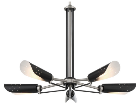
Shown in brushed nickel / coal

PRODUCT DIMENSIONS . . . . . Canopy: 5" diameter x 0.63"H