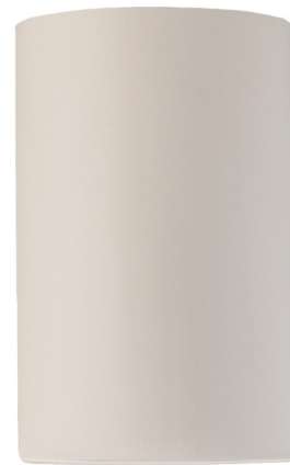
Shown in matte white

Make a big statement with your indoor lighting choices courtesy of the Justice Design Ambiance Large Cylinder Open Top and Bottom Wall Sconce. This beautiful wall-mounted light is made from hand-cast, hand-finished ceramic material and will not rust or corrode. This luxurious, energy-efficient wall sconce is damp location rated, and will effortlessly flood your indoor space with crisp, ambient light. Reimagine how beautiful your living room, entryway, bedroom, hallway or finished basement space can be with Justice Design lighting.