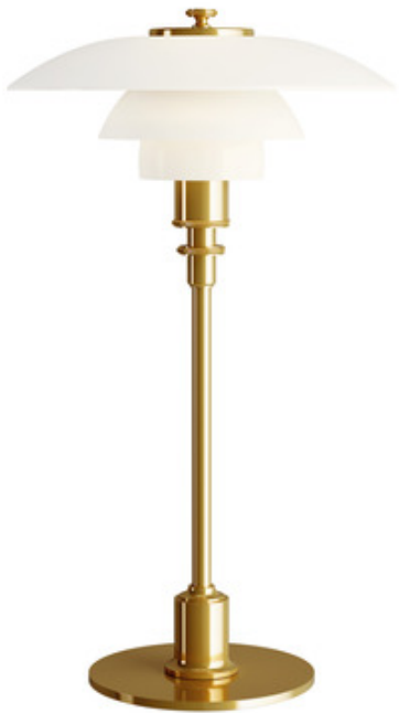
Shown in: Brass / Opal

The PH 2/1 Table Lamp adds a clean decorative touch to your interior space. The three shade system with body in metallized brass or black, or high lustre chrome plated, emits comfortable diffused and warm light through the opal glass diffusers down and across your room. On/Off switch is located on the cord.