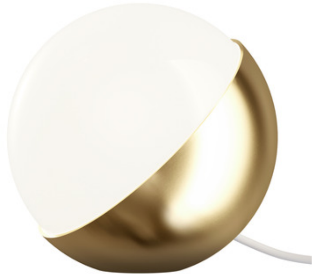
Shown in: Brass / Opal

The VL Studio Table / Floor Lamp brings a clean, almost out of this world, look to your interior space. The mouth blown glass diffuser casts warm shadows across your room. Can be placed on a table or the floor, where ever you need an extra glow of light. Note: Brass finish is lacquered and the untreated brass will change over time and develop a patina. 5.9 inch option includes on/off switch on cord. 9.8 and 12.6 inch options include an electronic dimmer switch (requires dimmable bulb).