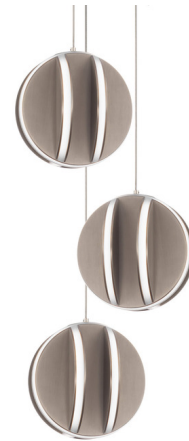
Shown in brushed nickel / white