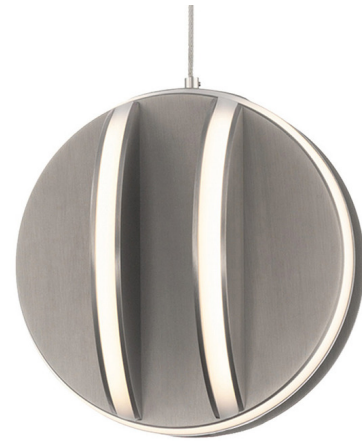
Shown in brushed nickel / white

The Carillion Pendant features an edge-lit sphere made of aluminum and silicone diffusers. It appears to float in the air as it hangs from an unobtrusive powered cable. This mini pendant embodies modern lighting design, perfect for delivering ambient light to contemporary spaces including dining areas and kitchen islands. Dimmable with a TRIAC or ELV dimmer, sold separately.