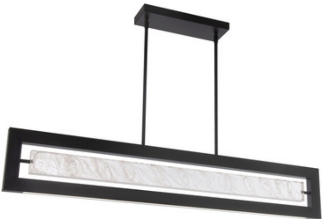
Shown in: Black / Cloudy

The Equilibrium Pendant features an artisan-crafted clear acrylic panel patterned with milky swirls, framed by a bold aluminum rectangle. The metal frame emits an uplight and downlight through polycarbonate diffusers to provide ambient lighting and highlight the acrylic decoration. With its sleek geometry, the Equilibrium blends well with contemporary kitchens, dining rooms and bars. It includes a universal driver and is dimmable with a TRIAC, ELV, or 0-10V dimmer, sold separately.