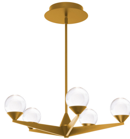
Shown in aged brass / clear

A laser-etched crystal ball is illuminated by each LED light on the Double Bubble Chandelier, creating mesmerizing multi-layer bubble effects. With these unique crystal elements and a geometric frame in a modern finish, this piece brings sophisticated flair to dining areas, foyers, and living rooms. The fixture includes a universal driver, dimmable with a TRIAC, ELV, or 0-10V dimmer, sold separately.