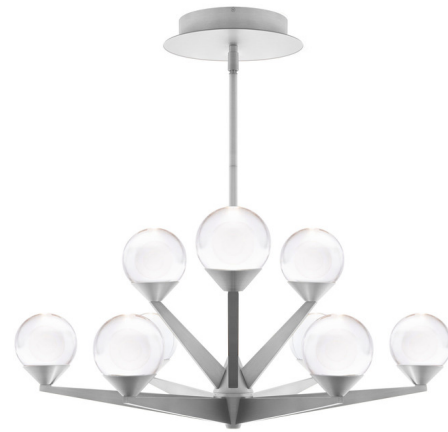
Shown in satin nickel / clear