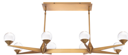
Shown in aged brass / clear