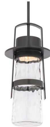
Shown in oil rubbed bronze / clear hammered