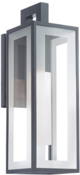
Shown in: Black / Clear

The Cambridge Outdoor Wall Sconce embodies timeless style with its simple black aluminum frame and clear glass panels. Light is emitted from an etched acrylic diffuser inside and highlights the frosted borders of the glass as it radiates into your space. This sconce can be installed facing up or down. Place a pair at your front entrance to greet guests, or on a patio or porch to create a warm ambiance. Dimmable with a TRIAC or ELV dimmer, sold separately.