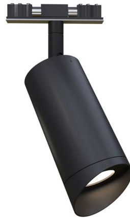
Shown in black