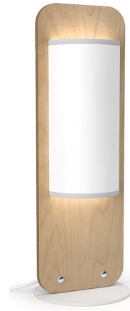
Shown in natural / white

The Flat Table lamp brings a bold decorative look to your interior space. The uniquely shaped CNC cut plywood body rests on a White powdercoated steel base. The integrated shade adds soft light that illuminates the wood base and surrounding area. Dimmer switch is located on the cord.