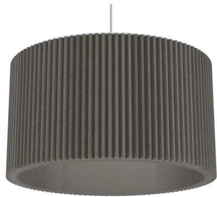
Shown in white / dark grey

The Absorber Pendant adds both beautifully warm light with acoustic technology to to your exterior space. The pleated shade absorbs sound waves which is perfect for high ceilings and large spaces. Made of recycled plastic bottles that absorb sound and reduces reverberation. Includes acrylic bottom diffuser.