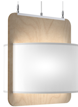
Shown in natural / white

The Flat Pendant brings a bold decorative look to your interior space. The uniquely shaped CNC cut plywood body hangs on a steel frame. The integrated shade adds soft light that illuminates the wood base and surrounding area.