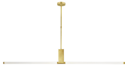
Shown in natural brass / clear

LAMP LIFE . . . . . 50000 hours COLOR RENDERING . . . . . 90 CRI LAMP COLOR . . . . . 2700K LUMENS/WATT . . . . . 107.50 LUMINOUS FLUX . . . . . 559 lumens