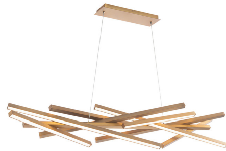
Shown in aged brass / white