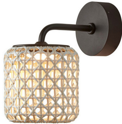
Shown in graphite brown / beige

COLOR RENDERING . . . . . 90 CRI LAMP COLOR . . . . . 2700K LUMENS/WATT . . . . . 77.67 LUMINOUS FLUX . . . . . 466 lumens