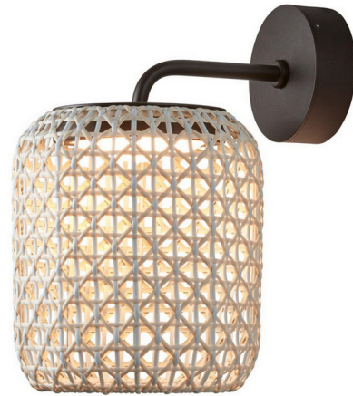
Shown in graphite brown / beige

COLOR RENDERING . . . . . 90 CRI LAMP COLOR . . . . . 2700K LUMENS/WATT . . . . . 152.63 LUMINOUS FLUX . . . . . 1450 lumens