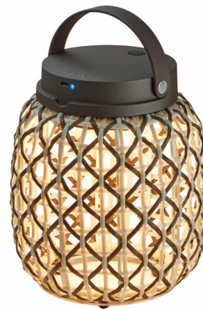
Shown in graphite brown / brown

COLOR RENDERING . . . . . 90 CRI LAMP COLOR . . . . . 2700K LUMENS/WATT . . . . . 153.33 LUMINOUS FLUX . . . . . 460 lumens