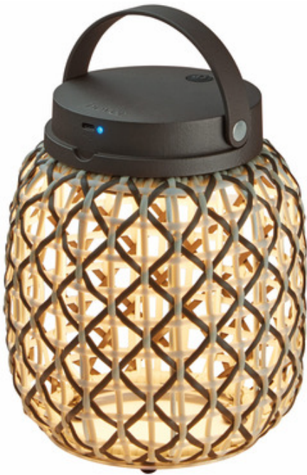
Shown in: Graphite Brown / Brown

Use the Nans M/21/R Portable Table Lamp to bring convenient illumination and a relaxing ambiance to any indoor setting. Its intricate shade is made of recyclable, non-toxic polyethylene strands hand-woven together in a design inspired by the Mediterranean coast. A polycarbonate diffuser softens the energy-efficient LED light, and a push button on the top turns the lamp on/off and switches it to three brightness levels: 33%, 66%, 100%. This cordless lamp includes a USB charging cable, charges in 7 hours, and operates for 12 hours at full brightness when fully charged.