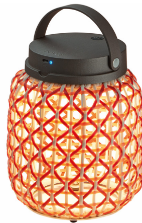
Shown in graphite brown / red

COLOR RENDERING . . . . . 90 CRI LAMP COLOR . . . . . 2700K LUMENS/WATT . . . . . 153.33 LUMINOUS FLUX . . . . . 460 lumens