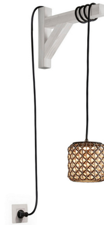
Shown in graphite brown / brown